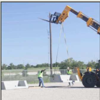
1. Set Bases