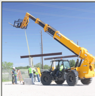
2. Set Towers