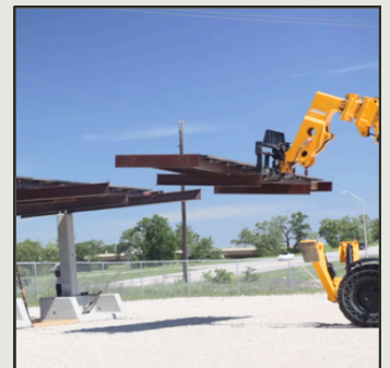
3. Set Wings